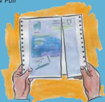
Grip & Pull